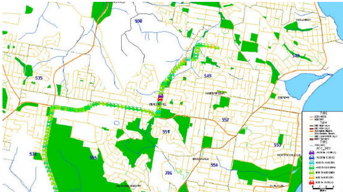
Figure 8 Point Layer Colour Coded for Acceleration and Deceleration

The next step in the process is to convert the point layers to line layers, and to do this in such a way that the individual trips are offset from each other, to allow one to distinguish individual trips that occur over the same stretch of highway. Figure 9 shows the initial trip layers, colour coded to distinguish one trip from another, but still represented by point data.