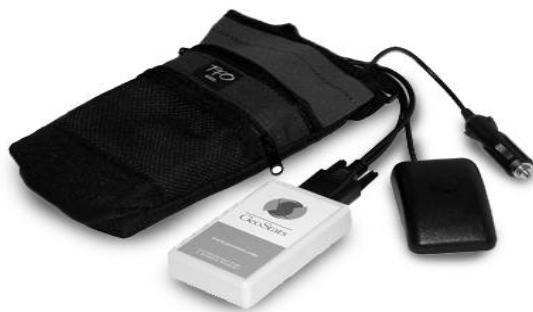
Figure 1 In-Vehicle GPS Device