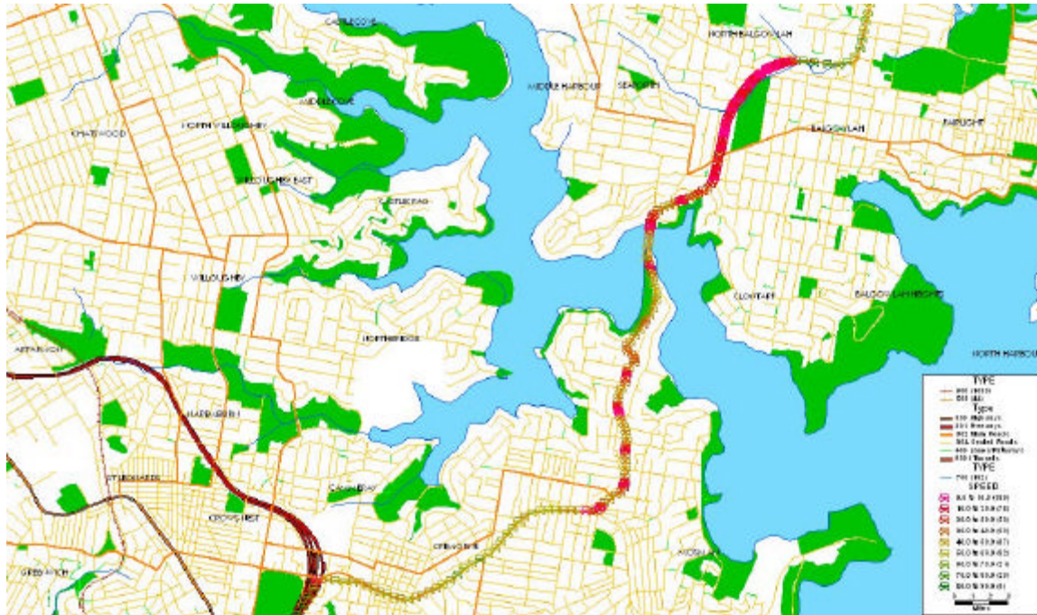
Figure 5 Point Data Coded to Show Speed

In Figure 5, the direction of travel is from the top of the picture to the bottom. The faster the speed, the more green (or light tone) is the symbol, while the slower the speed, the more red is the symbol (or dark tone). This clearly shows problems of severe congestion along the roadway north of the bridge. Sporadic and short-lived congestion occurs further south, followed by a fairly long distance at relatively steady speeds. Similarly, a second map (Figure 6), with this and another approach to the bridge at a slightly different time in the morning peak period, shows that there is congestion on all approaches, while south of the bridge, there is indication of increasing congestion later in the peak period.