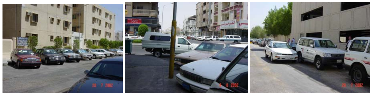
Figure 4 The inappropriate use of on-street parking

improperly parked and parking on intersection corners caused slow down of traffic and might cause safety concerns. Figure 4 presents these facts.