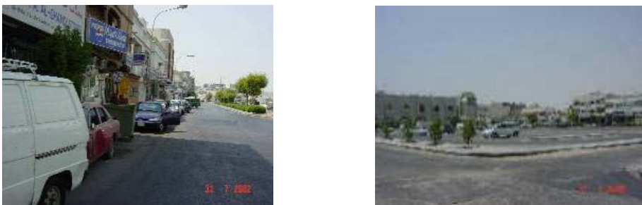
Figure 3 On street and off street parking

On street parking is the most convenient form of parking for users. It was evident through the field inspections that on street parking attracted most of the customers to shops and restaurants even there were off street car parks available but in a short distance. Figure 3 shows that people prefer to use on street parking even when off street parking available.