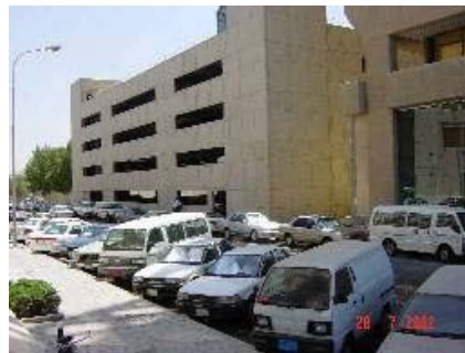
Figure 2 Empty parking building (full on street)

Off street parking facilities in the CBDs in the Eastern province of Saudi Arabia were limited. This is perhaps because that the available free on street parking spaces discouraged the investment on off street parking development. There were a number of off street parking buildings closing to the study areas. Some are accessible for public and some are for office workers only. Perhaps due to the unattractive locations, parking buildings opening for public were seriously under utilised. This evidence may further discourage people investing in parking services industry. It is likely that the future construction of off street parking building will mainly take place out of CBDs due to the limited spaces within the commercial areas. Figure 2 shows a building parking station. It can be seen that not many vehicles parked within the building but on street, even the temperature was extremely high. However, this situation may get improved once controlled on street parking being adopted.