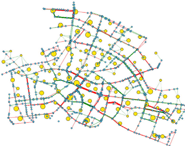
Figure 3: Berlin (M+P+F) flow differences between SO-fuel and UE-time.

Changes of flow comparing the SO-fuel solution to the UE-time solution are shown in Figure 3 for Berlin (M+P+F). In the figure, green arcs carry higher flow in the SO-fuel solution, while red arcs carry higher flow in the UE-time solution. The magnitude of change is indicated by arc thickness. The yellow nodes are source/sink nodes, where diameter represents demand originating from this node.